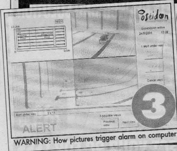
WARNING: How pictures trigger alarm on computer