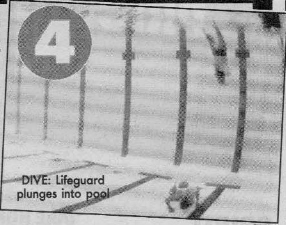
DIVE: Lifeguard plunges into pool